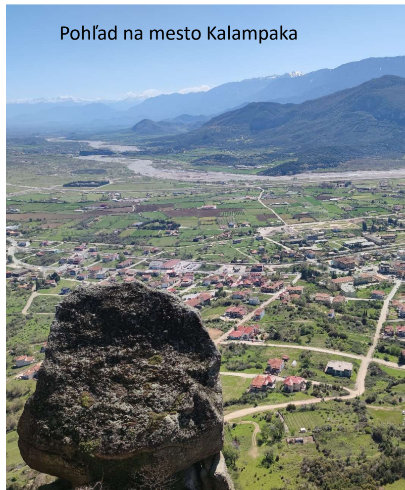
Pohľad na mesto Kalampaka