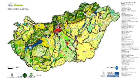
Landscape character areas of Hungary

Council of Europe, Budapest, European Youth Centre Room A 21 October 2021