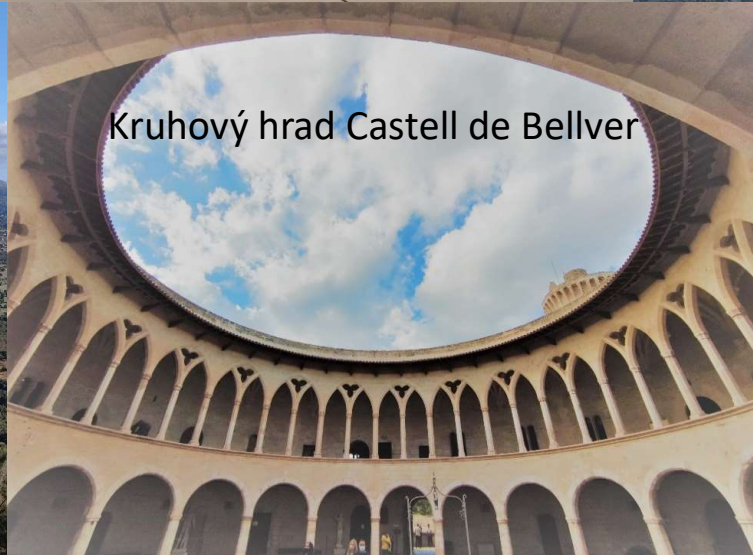
Kruhový hrad Castell de Bellver